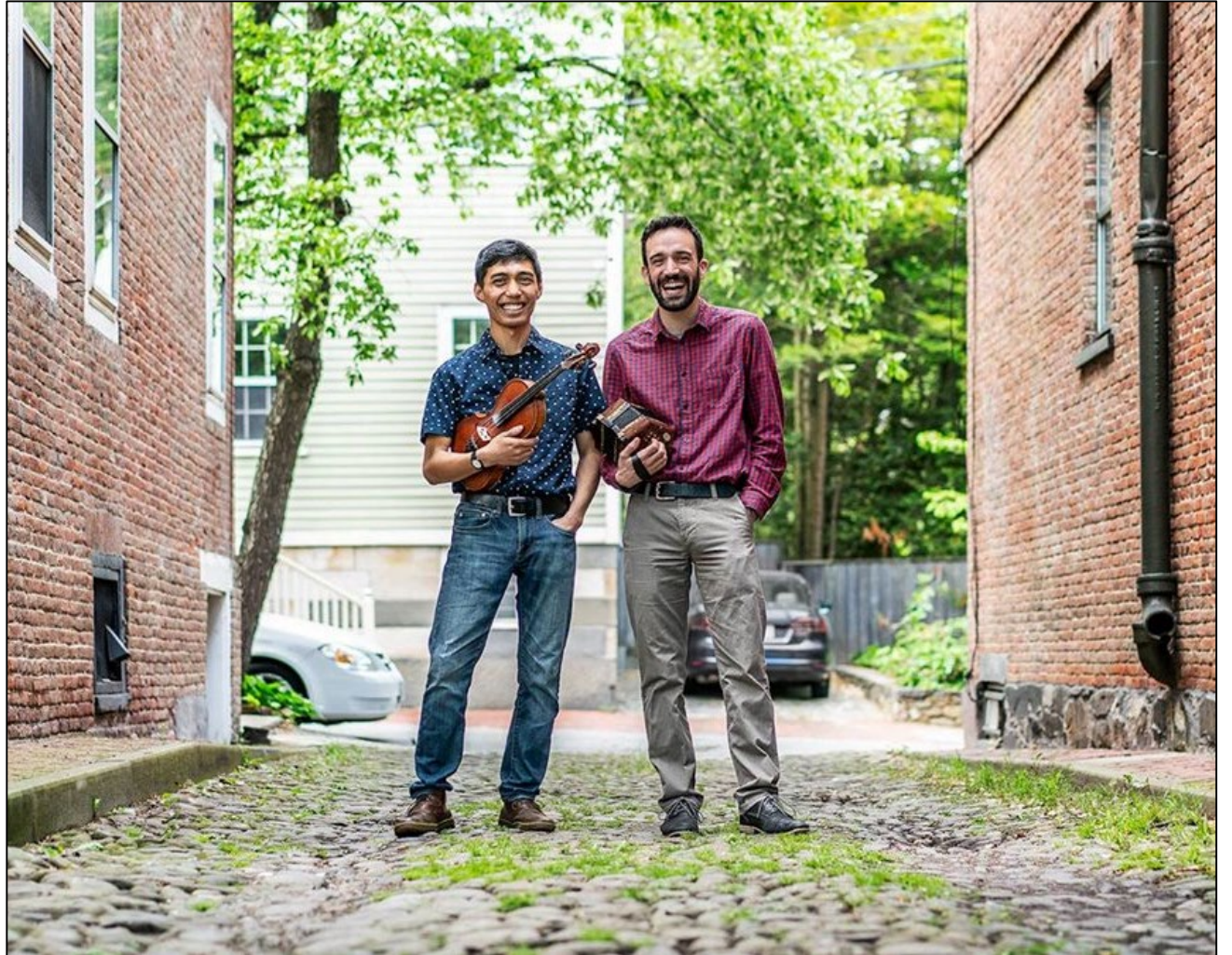
Blackstone River Theatre, Cumberland