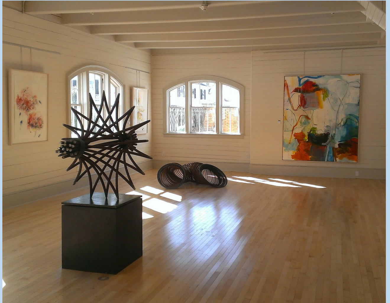
Bristol Art Museum

What do the final reports tell us so far?