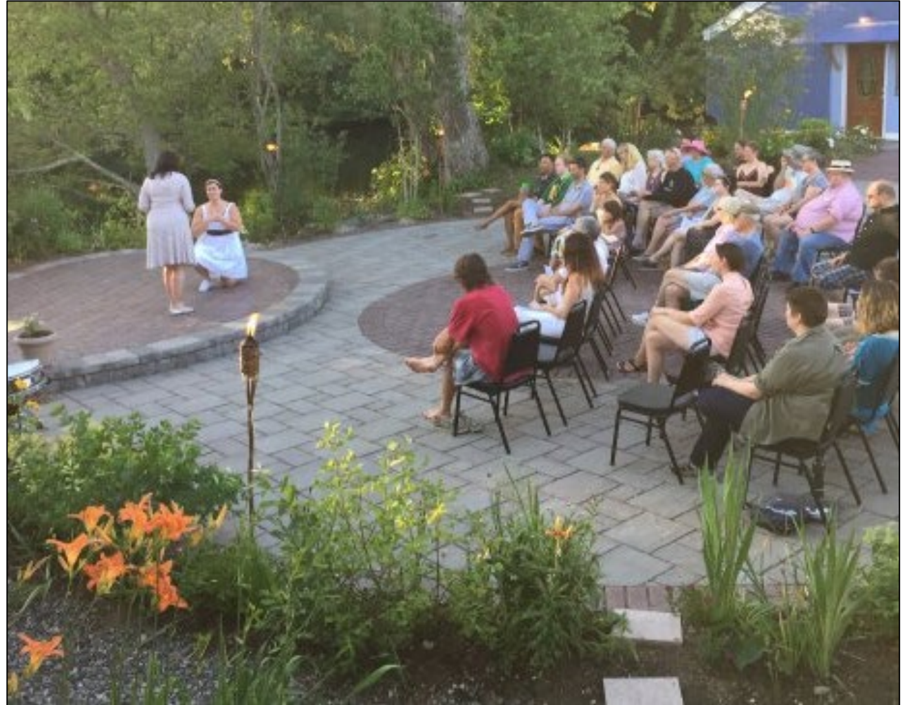
Contemporary Theatre, Wakefield

Also, (more difficult to measure), what impact has this initiative had on the vitality of the communities served by each of these grant recipients?