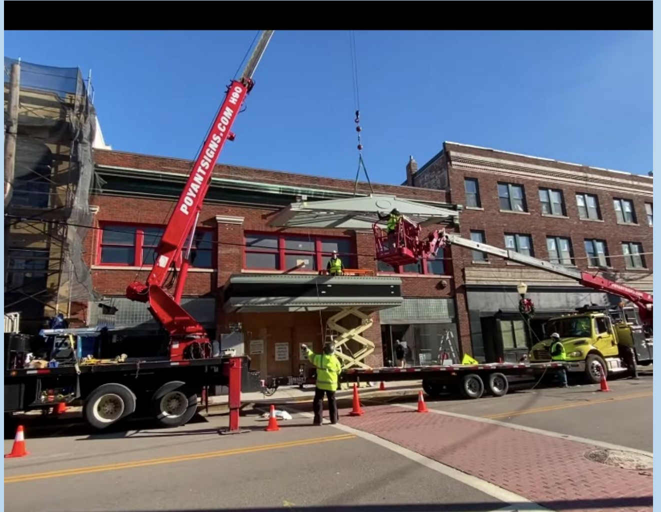
Installing the new marquee at the United Theater in Westerly

Of the $60,000,000 that grantees have spent so far, we have overseen payments to 354 Rhode Island companies in 38 cities and towns.